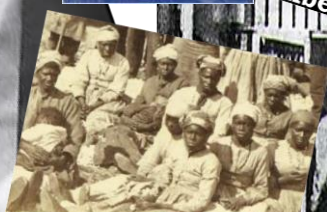
J Marion Simms